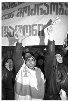
Opposition supporters arrive in Tbilisi, November 23, 2003.

Through its innovative media and Internet development programs, IREX and its local partners disseminated information about the candidates, the issues, and the vital role of the electoral process, encouraging increased citizen participation, promoting ethical and effective roles