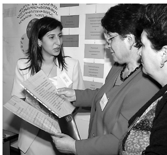
Three teachers share perspectives at the May 2003 ELT conference in Yerevan.