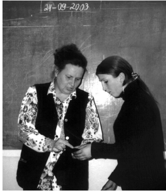
A woman learns job skills. IREX is now teaching women to become environmental monitors.

to conduct the necessary rigorous monitoring. Currently, there are only 300 specialists who are qualified to do this work.