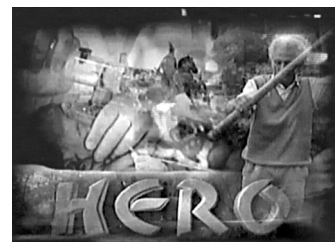
Title screen of Albania's Heroes television program, which receives production assistance and financial support through IREX's ProMedia program.

But IREX and local television producers realized that many citizens were