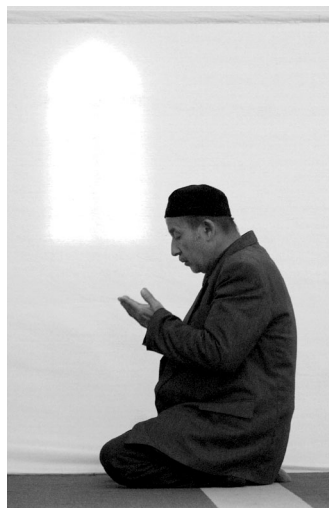
A man prays at a mosque in Uzbekistan.