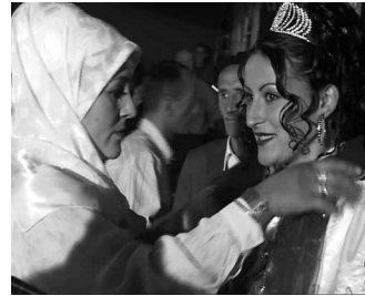
Young brides at the Teferich festival.

The film's producers aim to foster an understanding and appreciation of the cultural values of this population as well as "better understanding and tolerance between Muslim and Serb populations in Serbia and