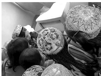
Young students at School no. 110 practice their new computer skills.

Uzbekistan that were awarded computers and training in 2003 through School Connectivity for Uzbekistan, a program of the Bureau of Educational and Cultural Affairs of the US Department of State.