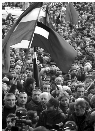
Opposition supporters arrive in Tbilisi, November 22, 2003.