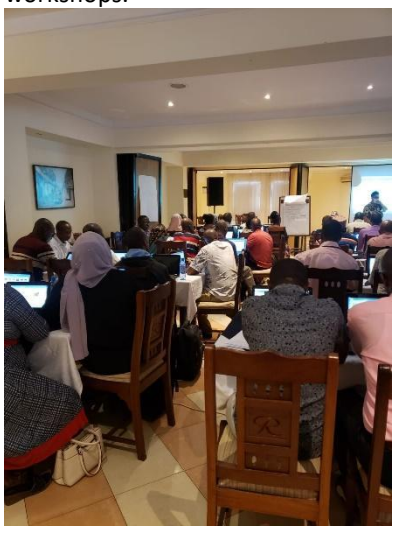
Image 3 The CSOs and their cofacilitators participating in the Training of the trainer's workshop.