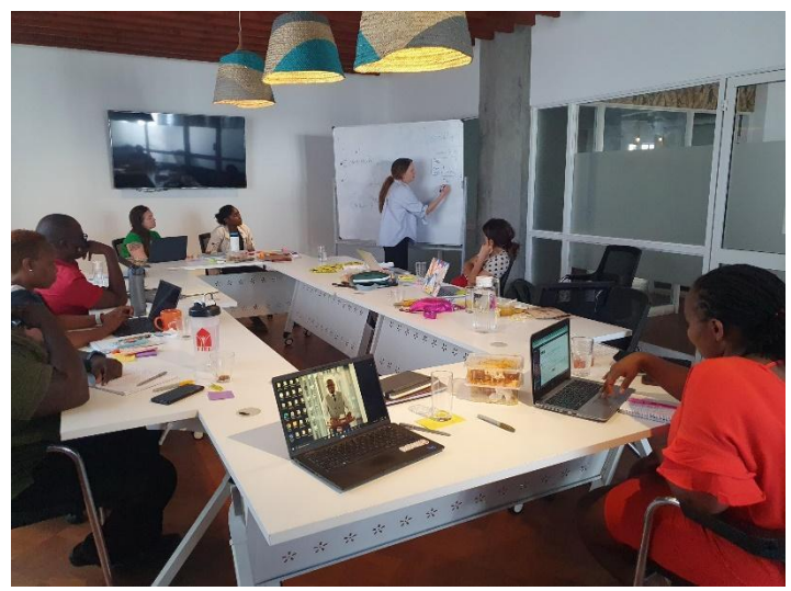
Image 5: The HWP sharing ideas and feedback from their conversations with the teachers and parents with the KPLAY team. Our research partners EDU Design were also present in the meeting.

They met 4 curriculum support officers from Kwale county and had a chance to share ideas on how to improve teacher support in the schools.